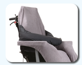
B54 - Cloth