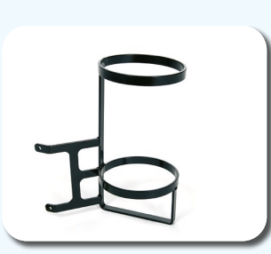
B83 - Canister holder