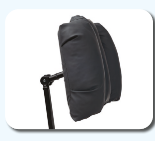
L58G - Comfort headrest