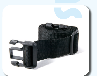
B20 - Safety belt