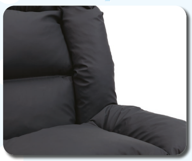
Each compartment features bead-filled cushions that provide optimum body & contour support.