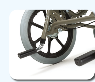
B77 - Anti-tipping