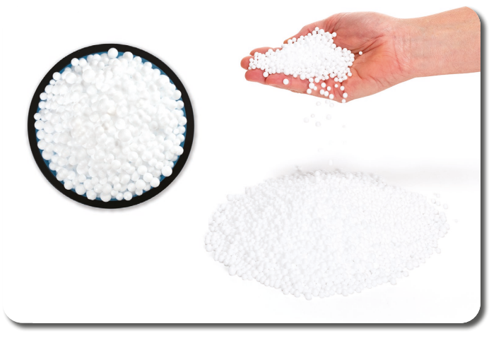
Insulated material provides a warm and comfortable feeling when seated.

From small front wheels to big rear wheels to solid rubber wheels for power wheelchairs... Every part is manufactured internally so that we can keep a close eye on the production and even more on the consistent quality that do us proud.