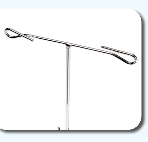
B52 - Serum holder