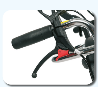
B74 - Drum brakes