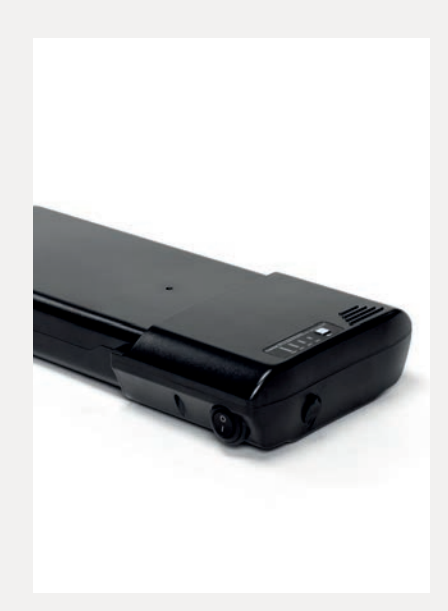
EXTRA BATTERY 12,8 AH OR 17,5 AH

To cater to a wide range of preferences and needs, we offered multiple options for you Plego. Store your Plego or add some additional features to suit you and your needs.