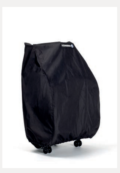
ESE45 STORAGE COVER