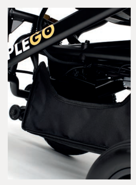
B64 STORAGE BAG UNDERNEATH THE SEAT