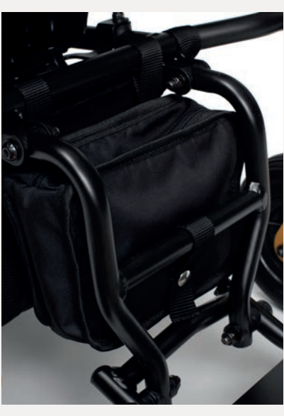
B63 STORAGE BAG BEHIND THE FOOT REST