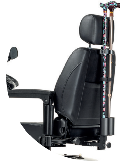
SW31 Crutch holder