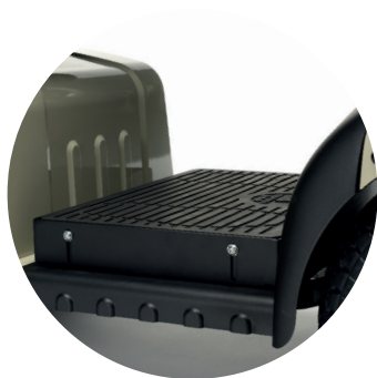
SW84 Elevated footplate