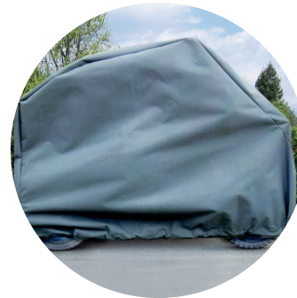
SH08 Scooter cover