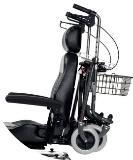
SW06 Rollator holder