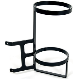
B83 Oxygen Cylinder holder