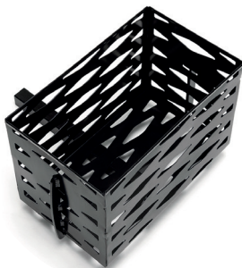
SW83 Oxygen holder